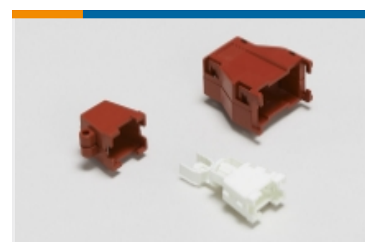
Rectangular Boots &amp; Strain Relief(1)