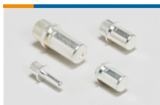
Busbar Connector Contacts(1)