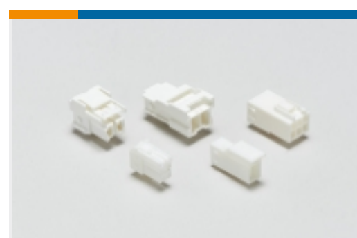
Rectangular Power Connectors(6)